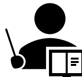
SSD replacement training