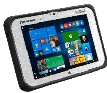
TOUGHBOOK M1 7" Windows tablet